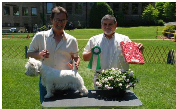
Best In Sweeps