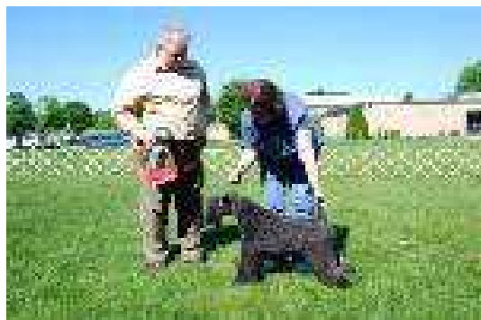
Best In Match