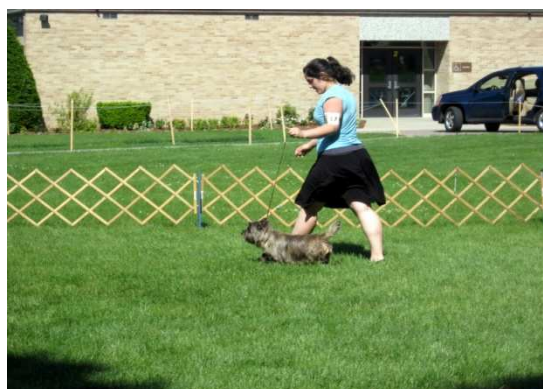
Around the ring